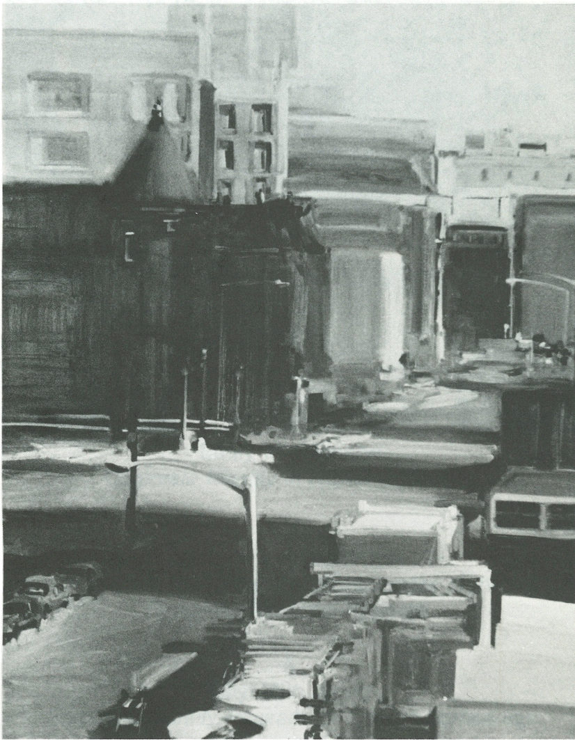
Lorraine Chiorazzi-Crain Washington Circle , 1987-88 Acrylic, oil on canvas 48" x 38"