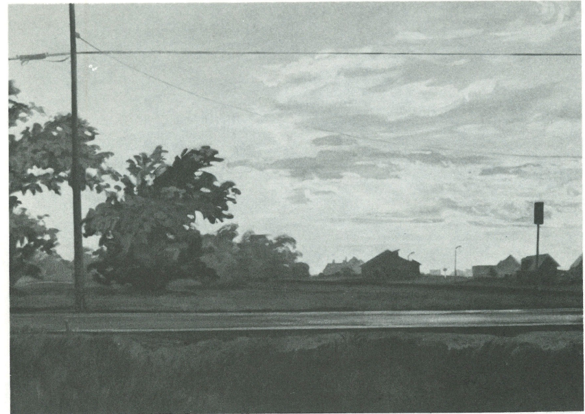
Karen Margo Lee Windswept Landscape , 1988 Oil on canvas 30" x 42"