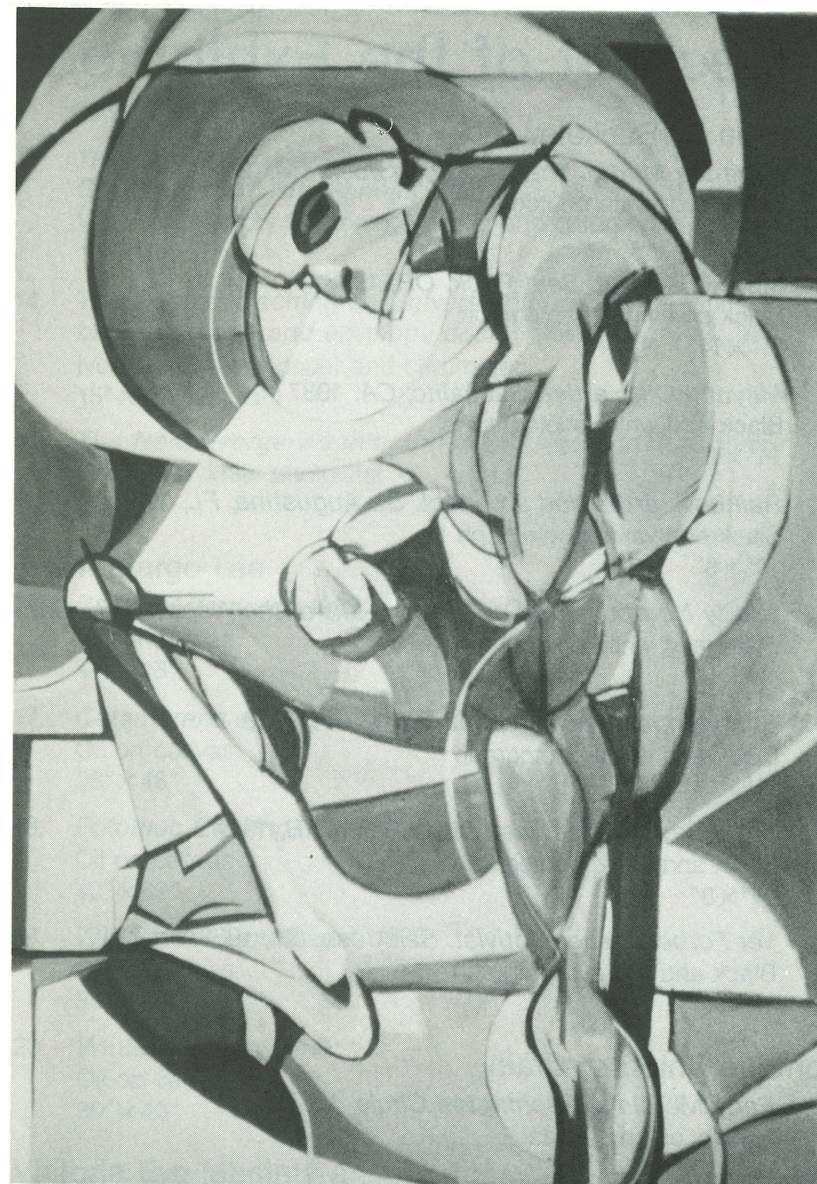
Robert "Nip" Rogers Robotic Rhythms (Panel #1 of the polyptych), 1988 Acrylic on canvas 58" x 180"