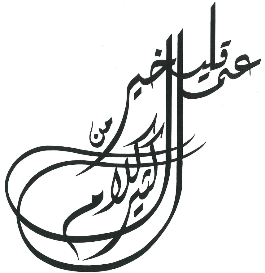
May E. Geadah Action Speaks Louder than Words , 1989 Chromatec on paper 15" x 12"